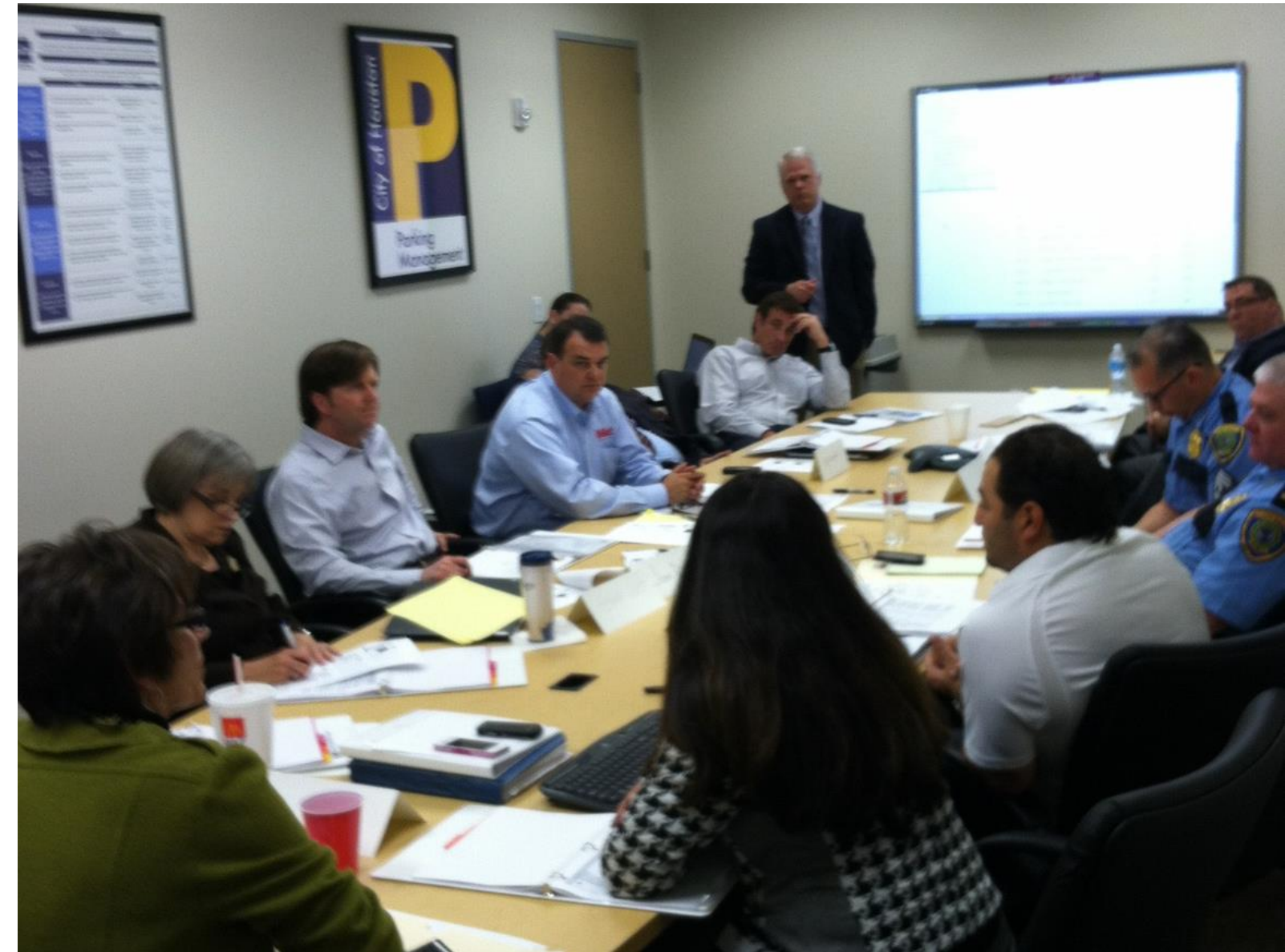
Washington Avenue PBD Advisory Committee First Meeting 2013