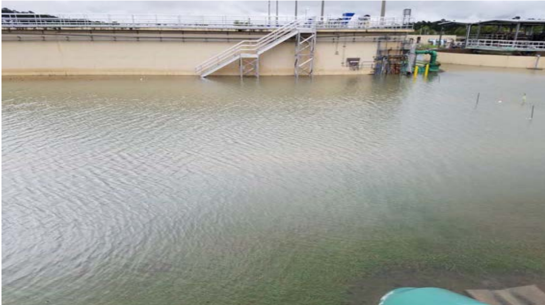
Northeast Water Purification Plant

Houston Public Works maintained the operations of water & wastewater treatment plants