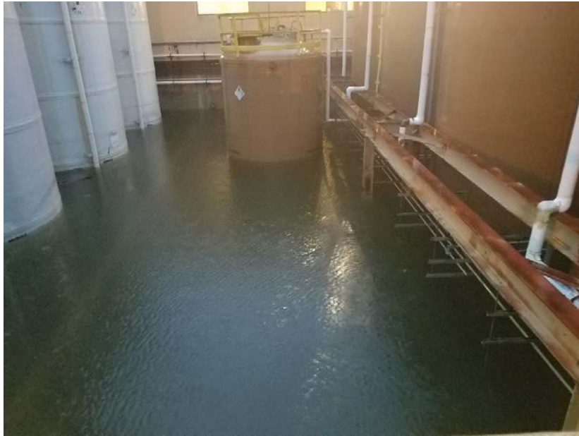
Southeast Water Purification Plant