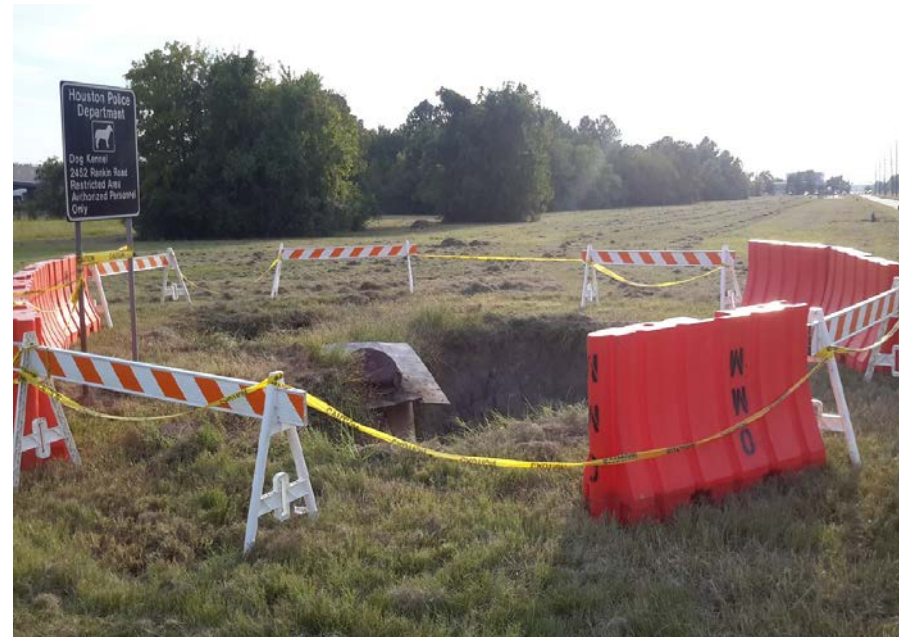
2452 Rankin Road