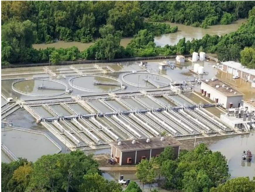
West District Treatment Plant