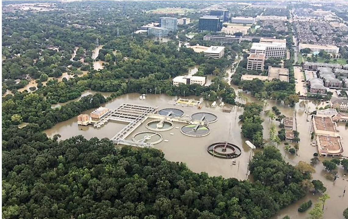
Turkey Creek Wastewater Treatment Plant