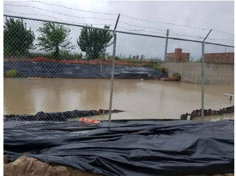
East Water Purification Plant