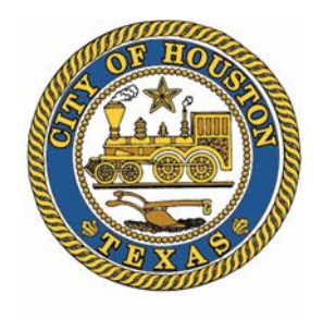
Mayor Sylvester Turner