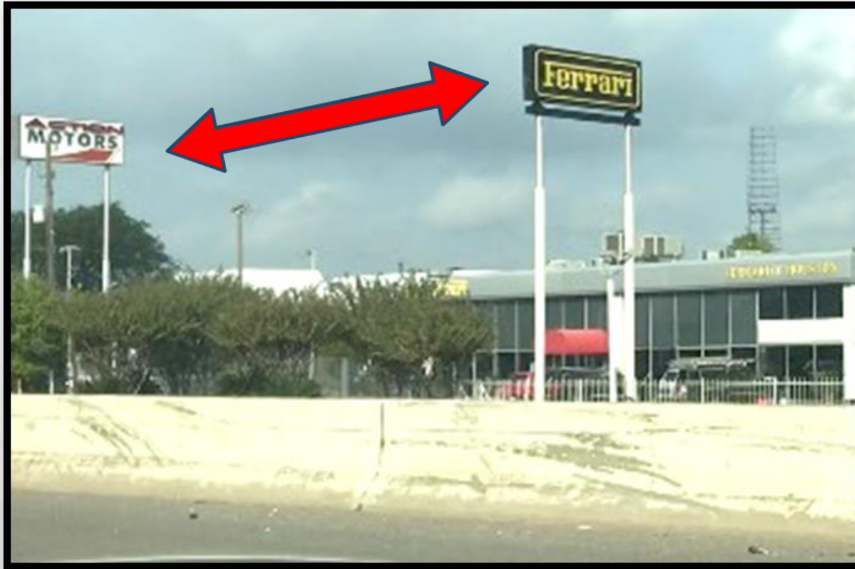
“Category C” Signs