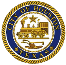
Mayor Sylvester Turner