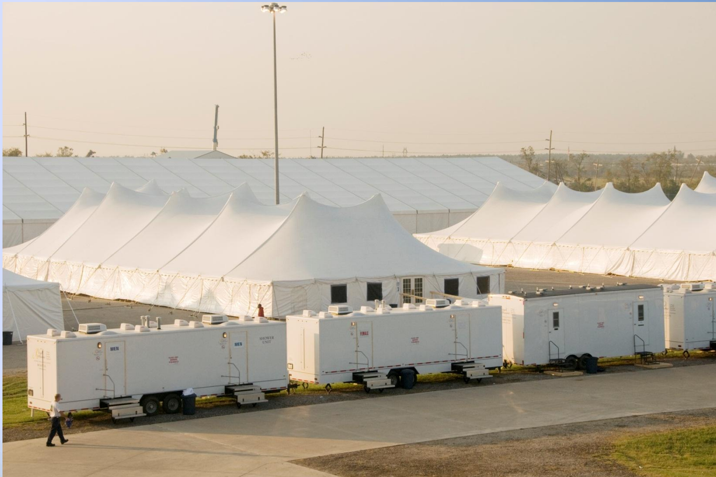
2,000 Person Base Camp for FEMA & Contractor Personnel Responding to Hurricane Gustav & Ike