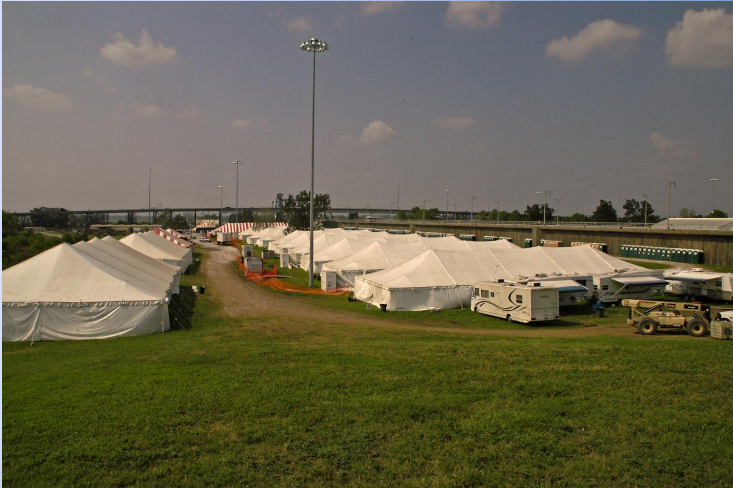
1,400 Person Base Camp for Emergency Workers Responding to Hurricane Katrina