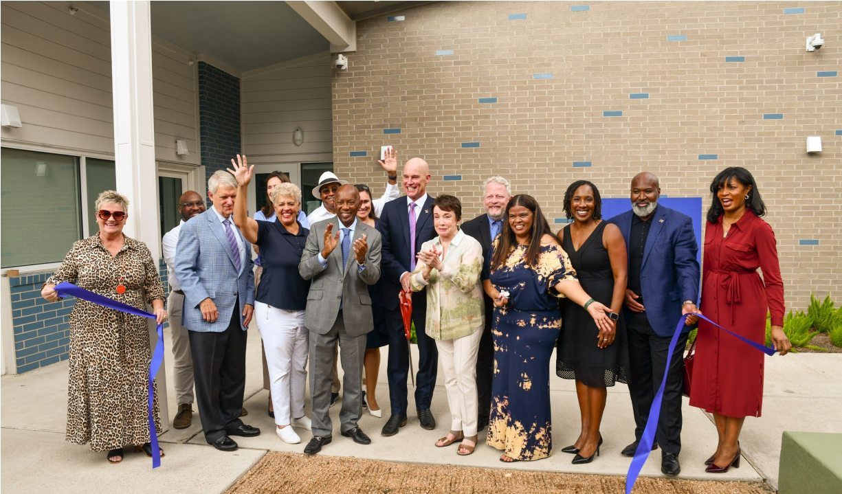
Ribbon Cutting Ceremony: September 29, 2023.