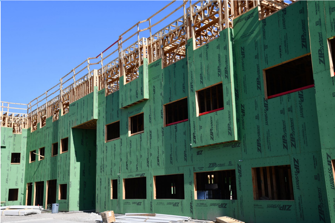
Progress as of October 2023.