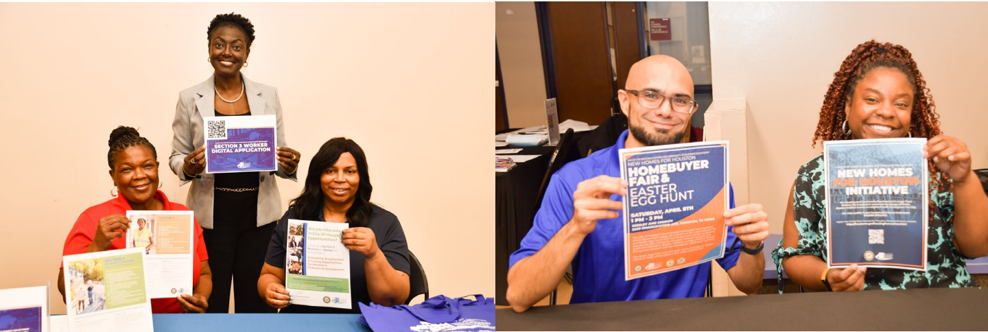
HCD Staff distributed flyers on program information.