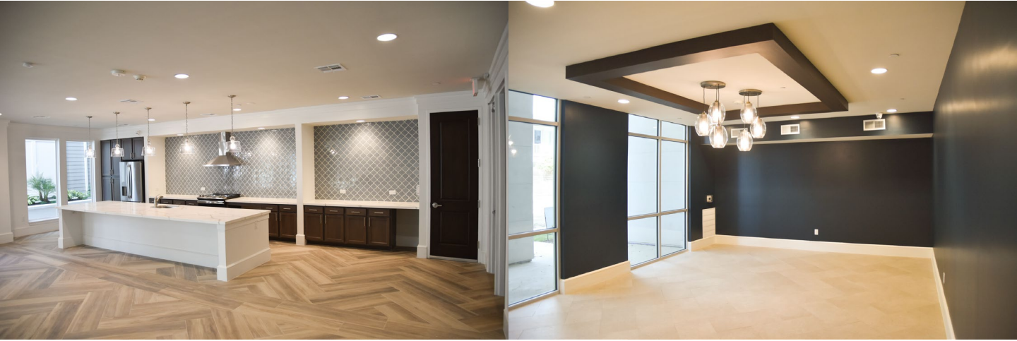
Lobby/Lounge as of April of 2023.