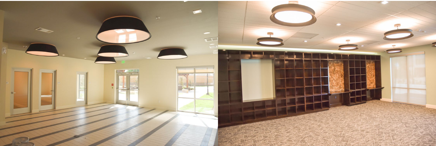
Indoor Common Areas as of April of 2023.