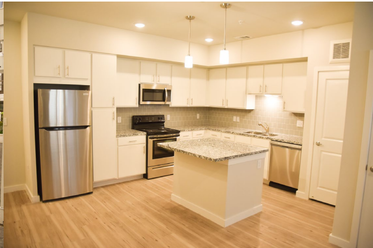
Courtyard and kitchen of typical unit as of April of 2023.