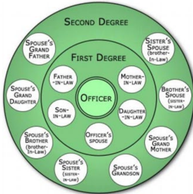
AFFINITY KINSHIP Relationship by Marriage