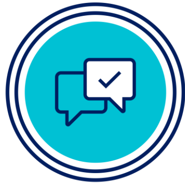
CUSTOMER ACCOUNT SERVICES