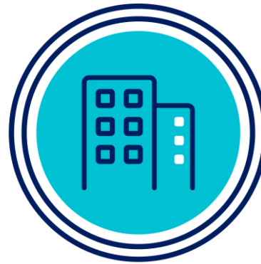
HOUSTON PERMITTING CENTER